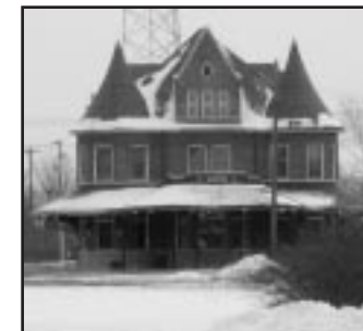
Northwest exposure, Winter 2000

Durand had been the second busiest Michigan rail station during the railroad peak of the 1900s. This depot served as the cross-roads of Michigan. The city grew up around the busy rail center, served by the single station and several railroads. The beautiful Chateau Romanesque station still stands and has been undergoing restoration for the past several years. The exterior has been restored to the original beauty. The station now houses archives, libraries, a museum, a model railroad club, and the Durand Amtrak station.