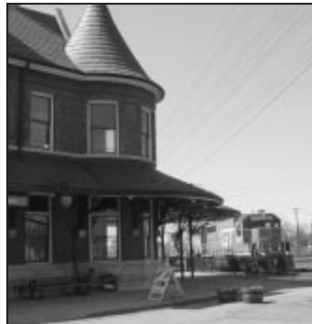
A Grand Trunk engine leads this intermodal eastbound on the Flint subdivision, March 2000.

The best location to watch trains in Durand is the station platform. Though some of the railroads and track no longer exists, the station still sits proudly at the diamond offering an unparalleled view. Today, the Grand Trunk/Canadian National have two subdivisions meeting at the diamond (the Holly and the Flint Subs). At the north end of the city the Central Michigan operates an interchange yard and has two lines – one to Bay City and another to Owosso. The Tuscola & Saginaw Bay Railway Company, Inc. (TSBY) operates through Durand on Grand Trunk's Holly sub connecting their track at the north end (to Cadillac) and south end (to Ann Arbor) of Durand. Normally the Durand Union Station and museum are open Tuesday through Saturday from 1:00pm to 5:00pm with restrooms and limited snack service. Rail fans have been known to park in the station's lot and watch trains from the platform all night.